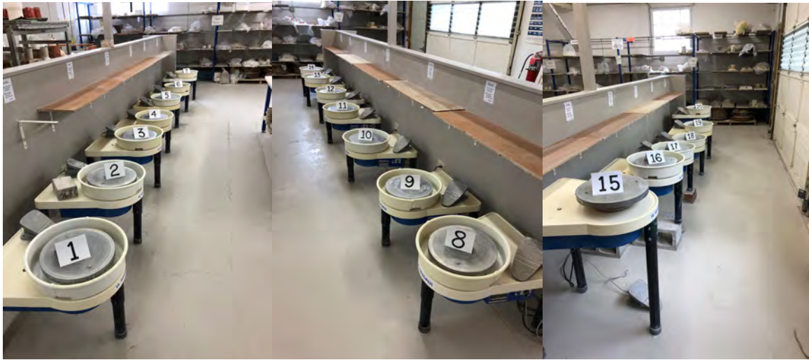
Clay Space Studio Layout with Reservation Location Numbers Indicated

Original Layout of the Wheels with Their Numbers These numbers correspond to the new placements in Sign Up Genius.