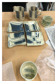
Allan's work shown at demo

In this workshop format, students will meet with Allan for a 3-hour class session each week for five consecutive weeks. In between the weekly class meeting time, students will be expected to do additional work — Clay Space will schedule several specific studio hours each week when students can come together to work on their individual projects, yet have class support. Or, students can work independently at home or during open studio hours. The overall workshop plan will be to make pots, dry, bisque, glaze, and fire them PRIOR to the next weekly class. In other words — pots will be dried and fired weekly so that students will have finished work to review and learn from at the following class meeting. Work will need to be small and relatively thin to accomplish this.