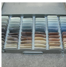
Allan's Color Palettes.... the possibilities!

Class Four will expand the colored clay process in additional directions.