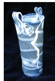
Vessel by Pam Horn (student work sample following Allan's demos)

Class One will introduce the horizontally layered colored clay process; the use of bisque forms; and a 3-color clay palette